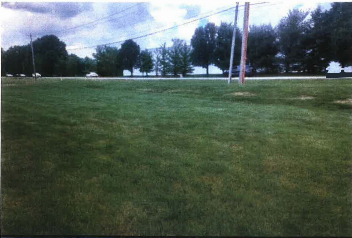
View from the police Department Towards Groupport Rd