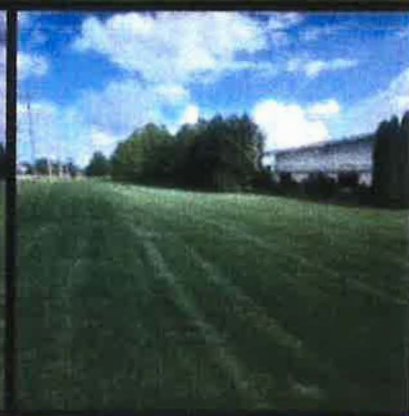
From left to right Street view from Police Station view from left side view from Right side