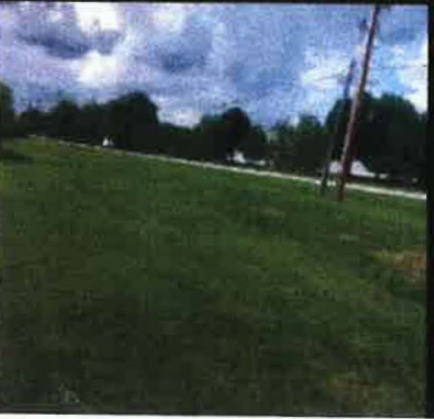
Right: From left to right in front of Station