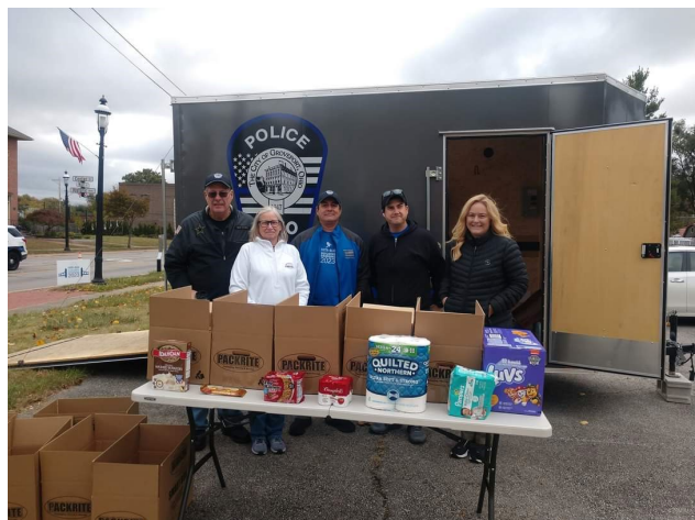
Cram the Cruiser the First Weekend of October