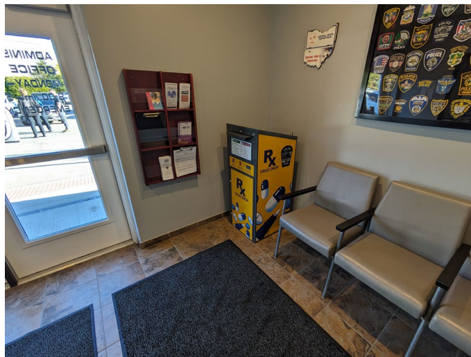
Prescription RX Drug Drop Off Box in Police Department Lobby

Groveport Police Department-5690 Clyde Moore Drive, Groveport, Ohio 43125 614-830-2060 office 614-836-4592 fax