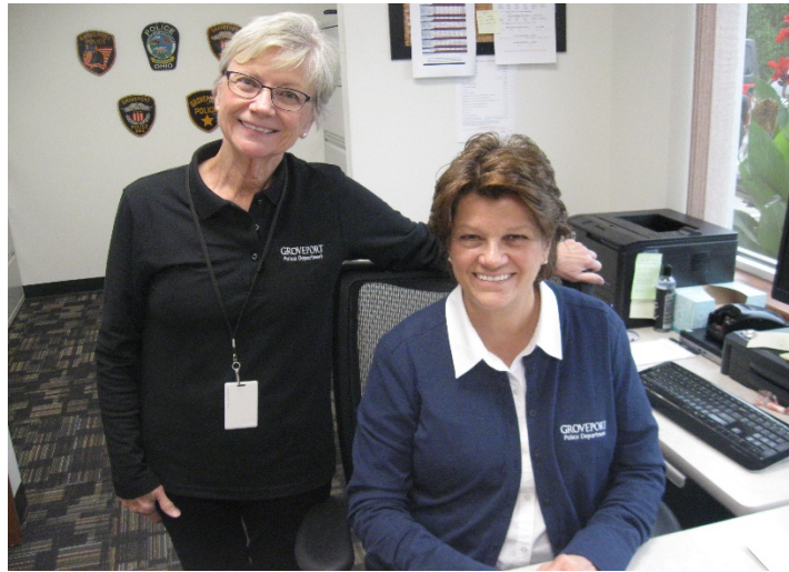
Groveport Police Department Administrative Staff in newly purchased police department logo wear purchased from uniform funds.