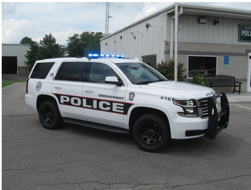
New 2020 Chevy Tahoe placed in service mid-August; vehicle replaced the 2015 Chevy Tahoe that was crushed by a falling tree on Front Street earlier this year.