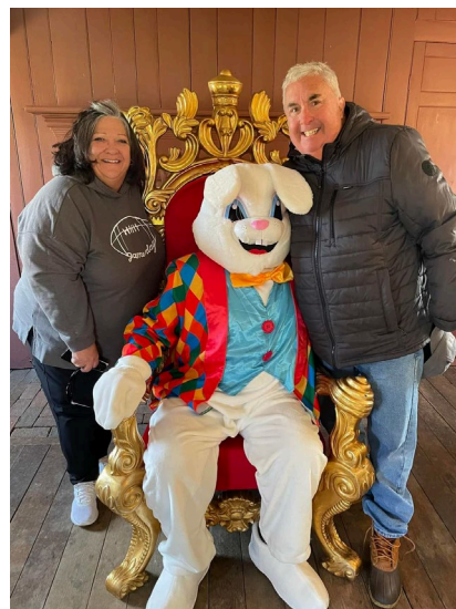
Return of the Easter Bunny March 23rd