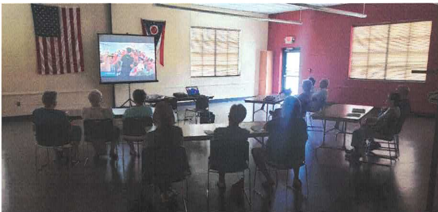
Armchair Travel to India sponsored by Ashford on Broad Senior Living